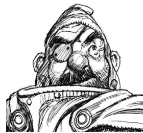
Carbo Steelnuts at the Cauldron Craft Festival

for the event. Wealth is on the increase and we have many customers wanting to dispose of their income. I hope we can help them as much as possible." The next Craft Festival is scheduled for the summer.