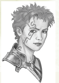
An impression of the villain, Triel Eldurast

"We have a lot to be thankful for. Many lives have been saved and this is due to the dedication of this fine group. As a result, we are commissioning a sculptor to begin work on a monument in their honour, to stand over our entrance way." Well deserved says the Cauldron Echo.