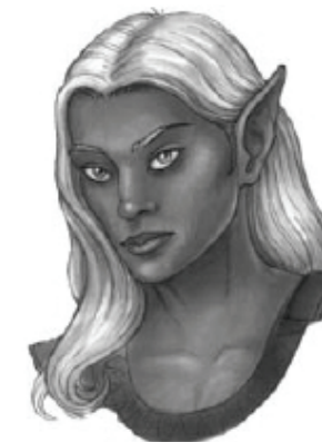
Shensen Tesseril of the Grove

"Well, not really. I'd like there to be but I don't think he's interested." No matter how hard we pressed, Shensen did not tell us who this might be. However, she is known to frequent the Drunken Morkoth so if you do too, you never know your luck. It may just be you.